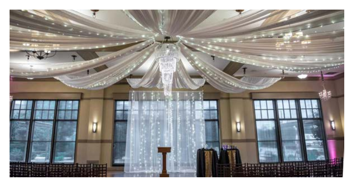
Service charge of 25% and sales tax of 8.25% will be added to the final bill. Package requires a minimum of 100 guests.

* Pricing is based on a minimum of 100 guests – if guest count decreases, pricing may increase accordingly